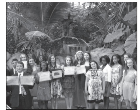
Sixth grade students from Shaffer and the Academy at the Awards Banquet