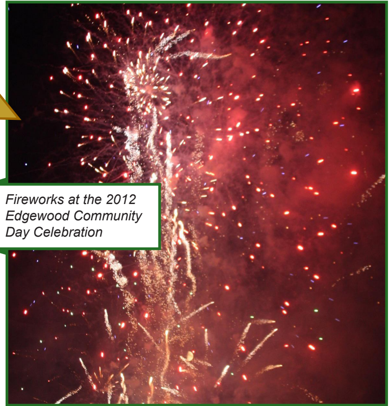
Fireworks at the 2012 Edgewood Community Day Celebration

Check the website for updates to the Schedule above: www.EdgewoodBoro.com .