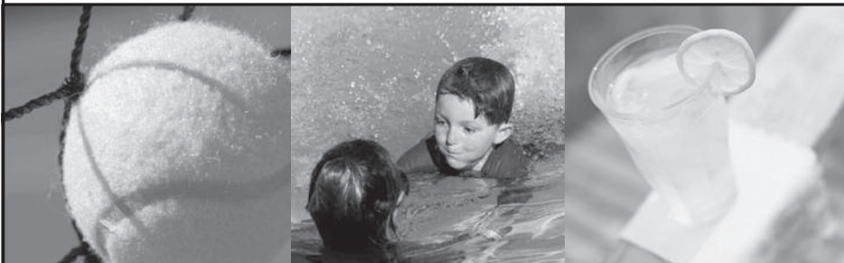
Our Idea of Networking