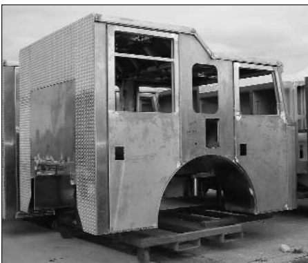
OUR BABY: The new fire truck is being assembled, as our fire company cleans house to make room for it. This is the completed cab ready to be painted. For more fire news, see page 7.